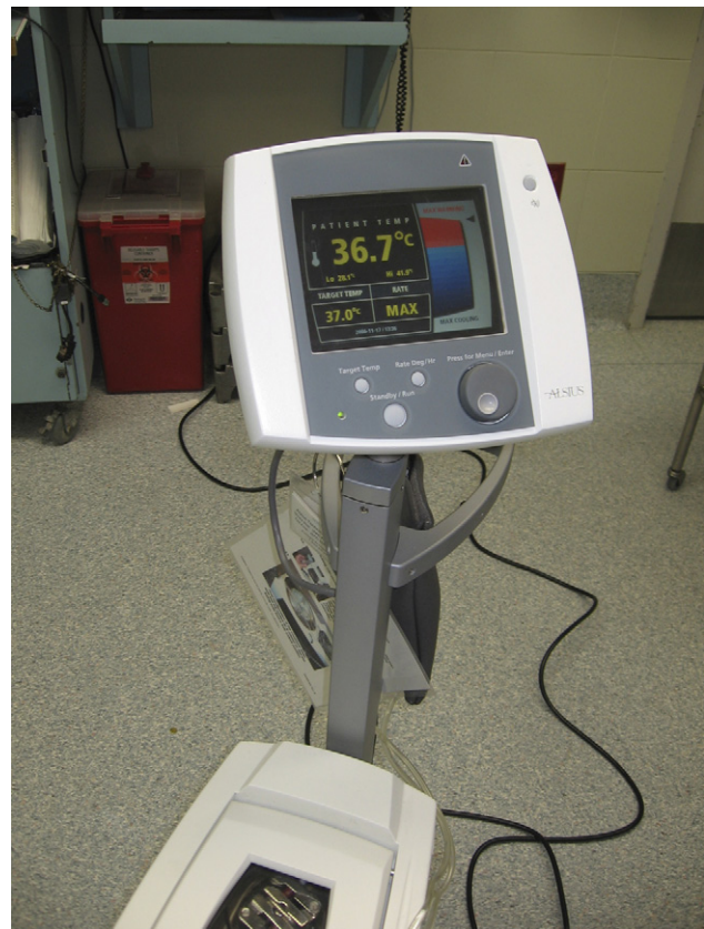
Fig. 2 – User interface for thermal management system.

standard temperature probe. The system adjusts the temperature of the fluid in the balloons until the preset target core temperature is achieved (Fig. 2) [7]. The catheter has been used mostly to induce hypothermia in patients with intracranial hemorrhage, ischemic stroke, head injury and spinal cord injury [8]. Hypothermia has been shown to be neuroprotective in some studies and it has been utilized in the perioperative management of patients after brain and spinal cord surgery [9,10]. There are sporadic reports of using hypothermia to management patients after resuscitation from major cardiac events as well [11]. The period of hypothermia ranges from several hours to 3 days in most studies and the patients are slowly re-warmed to a target temperature (usually 37^{\circ}\text{C} ) [12,13].