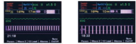
Depth and rate versions of the Real CPR Help Screen