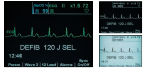
The EasyRead Tri-Mode Display provides three screen options: high resolution color, black on white, or white on black.

ECG signal processing extracts CPR artifact from the ECG so you can see organized rhythms without interrupting compressions.