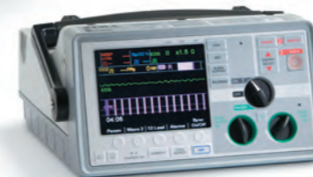
Small, compact, and lightweight briefcase-style design.