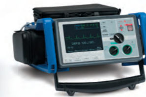
Optional roll cage offers even greater protection from the hazards of EMS.