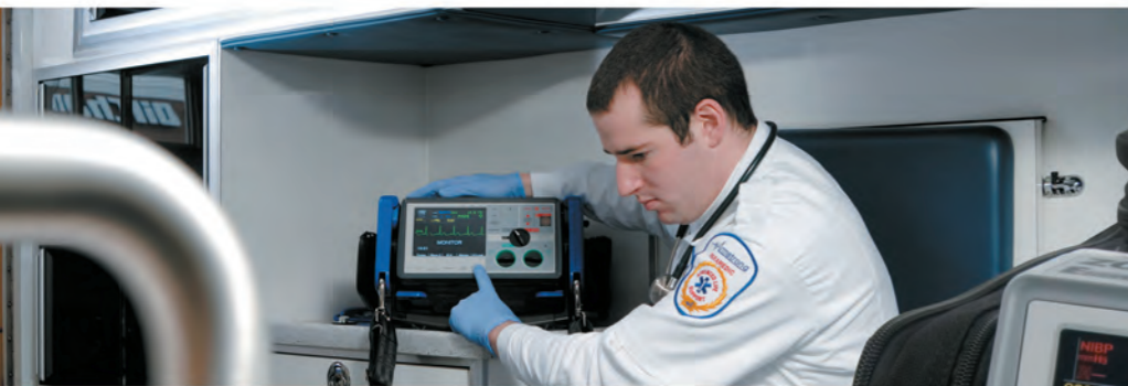
Optional softpack carry case